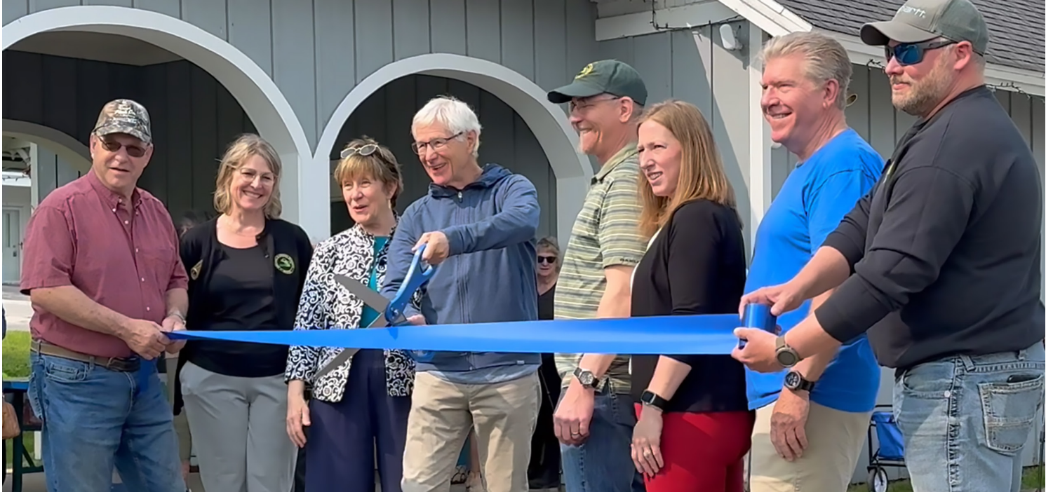
Proud participants in the ribbon cutting included members of the Friends, Benzie County government and the DNR.