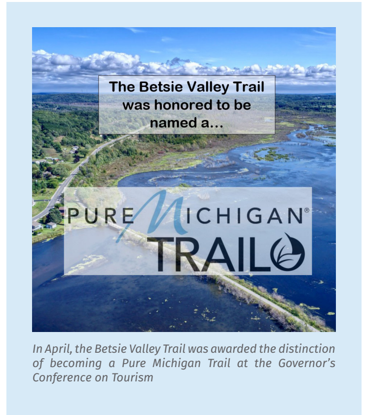
In April, the Betsie Valley Trail was awarded the distinction of becoming a Pure Michigan Trail at the Governor's Conference on Tourism

Please consider a donation to the Friends to help us make this important long-term project a reality!