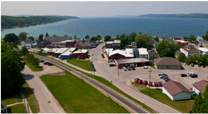
Drone image of 'First Mile' out of the beautiful Village of Beulah.

Making the trail to Thompsonville more accessible is a critical step in once-again establishing Thompsonville as a transportation hub, in the past for rail and in the future for non-motorized transportation. In addition to the new village park and campground being created by the Thompsonville Area Revitalization Project, it is expected future regional trail connections NE from Interlochen, SE from Cadillac, and SW from Manistee will all meet in Thompsonville.