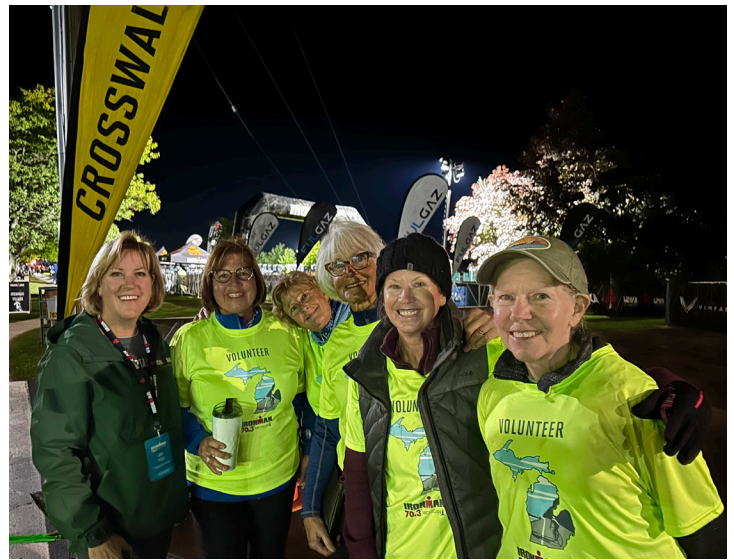
A few of the many Friends volunteers who were up early to help at the Ironman.