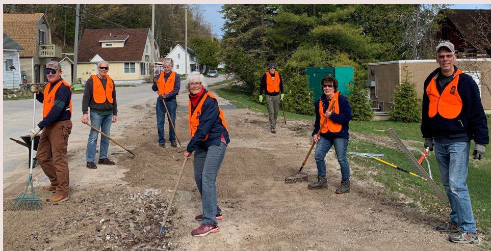
Trail Crew volunteers repair a portion of the Trail along Crystal Lake

We rely on our wonderful volunteers to keep the Trail clean and beautiful for all to enjoy. They often work on their own, using their own tools. We have volunteers who contribute in many other ways as well.