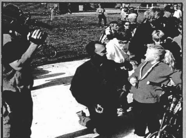
Tour 'de Tykes & Tour 'de Tiny Tykes, October, 2008