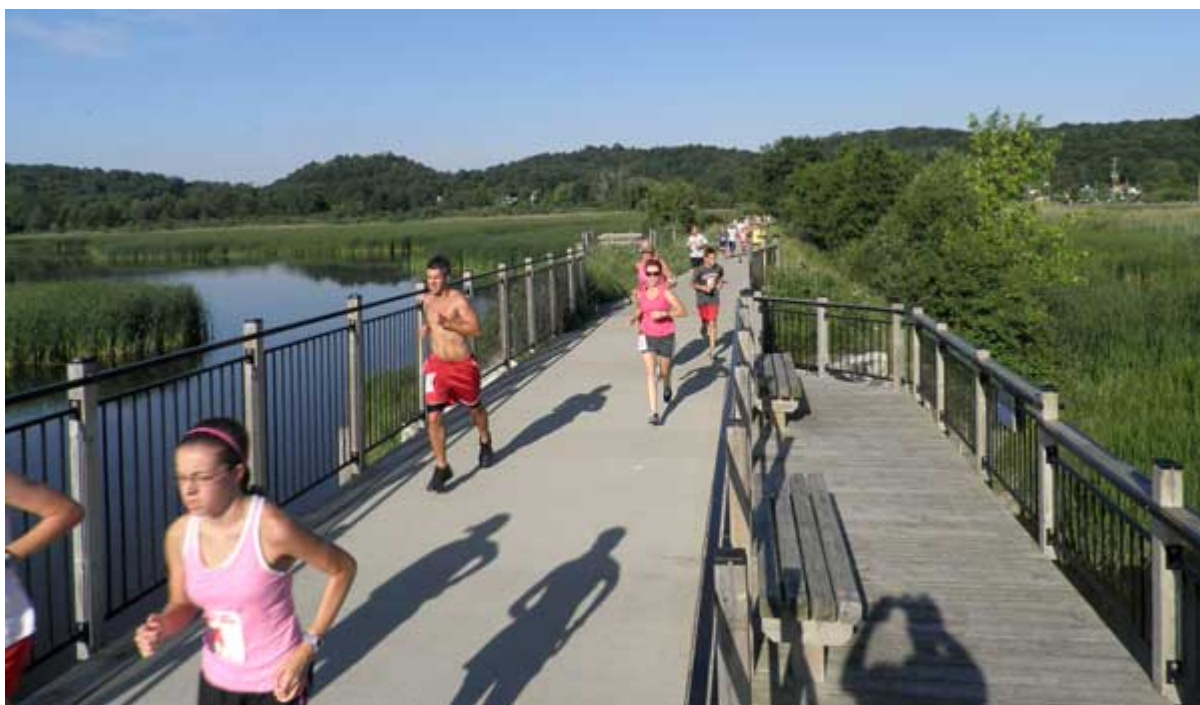
Midway in the 5K annual Port City Run